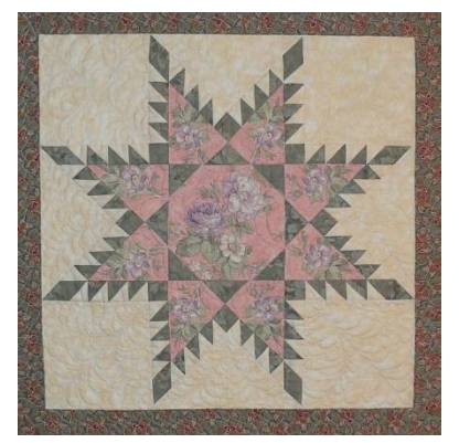
Feathered Star Traditional Setting 20" block