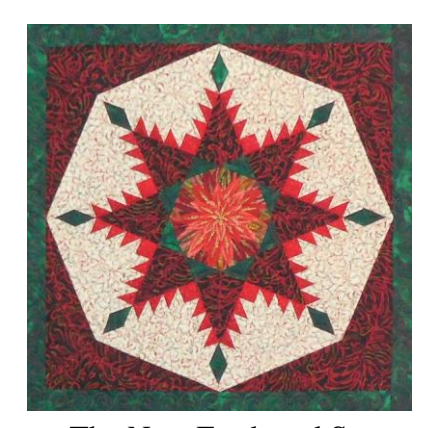
The New Feathered Star Set on octagon point, 22" block

Explore the fun of making the classic Feathered Star faster and more easily using Quick-Strip Paper Piecing for the feathers. Choose the Traditional Setting, left, or set the block on the octagon point, right, for the "New Feathered Star" option.